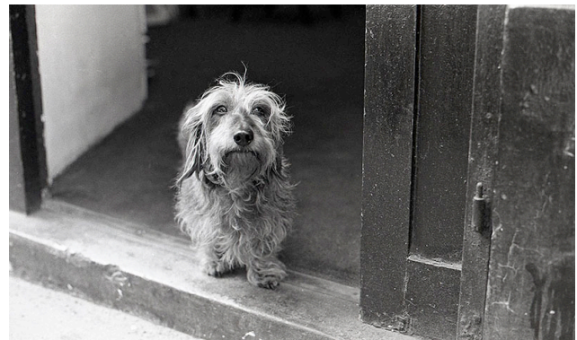
Rodin Museum guard, Paris; Concierge, Paris