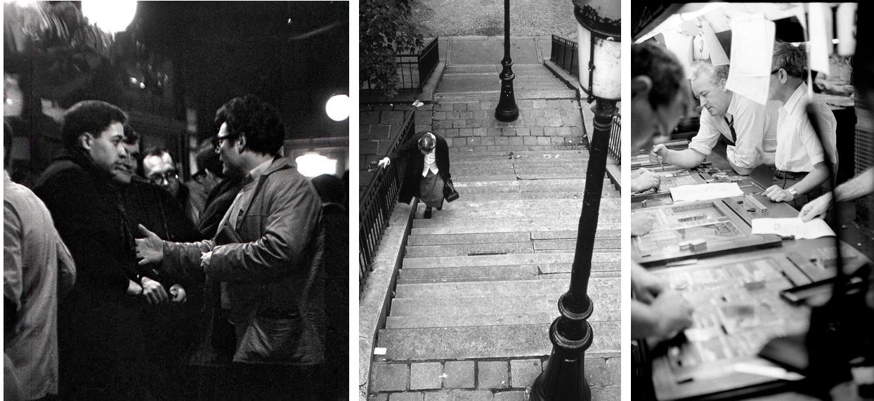
McSorley's Ale House, NY; Old woman on steps, Paris; New York Post make-up copy, New York