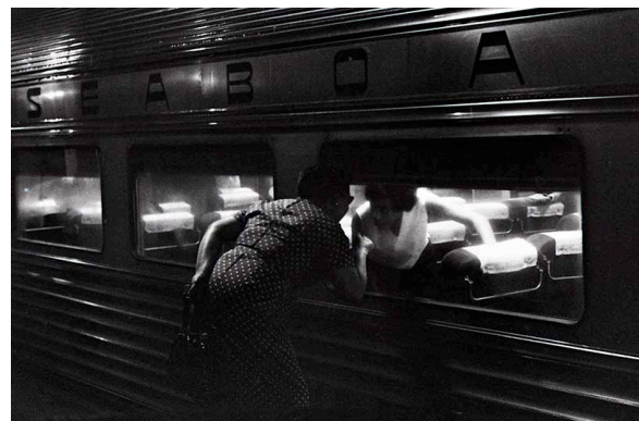
Rainy subway yard, Bronx, NY; Penn Station farewell, NY