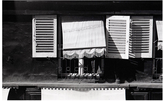
Alone in Paris; Morning Window, Paris